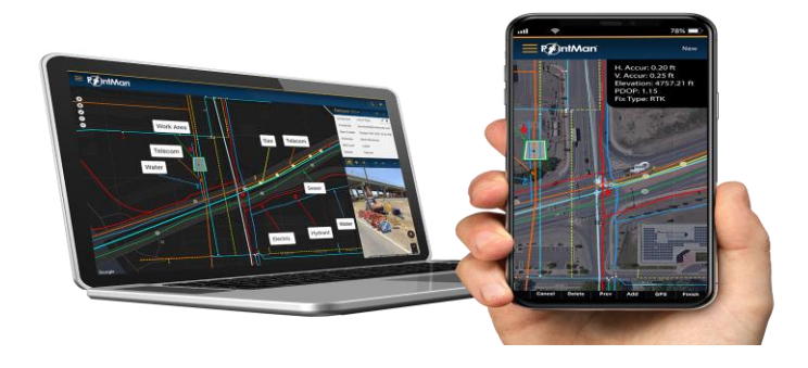
Exhibit 1: PointMan®

ProStar®'s precision mapping technology improves workflow processes and business practices entailed in managing critical infrastructure assets. The Company's solutions are used by some of the leading Fortune 500 firms from numerous industries, such as construction firms, Subsurface Utilities Engineering (SUE) firms, utility providers, government entities, and municipalities.