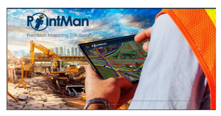
Exhibit 2: PointMan® – Precision Mapping Solutions

The Company's mobile underground utility mapping services enables capturing, recording, and visualization of critical infrastructure and utility data from a mobile phone. The software offers essential metadata with 1 cm accuracy of underground infrastructure that has the potential to prevent accidental damage to sub-surface infrastructure due to construction activities. Damage to underground utilities can cause electrical and communication outages. Worst-case scenarios can end up costing human lives due to the leaking of poisonous or harmful substances into water resources or even result in deadly explosions. PointMan® is designed to prevent these occurrences and improve the safety of employees, the public and the environment.