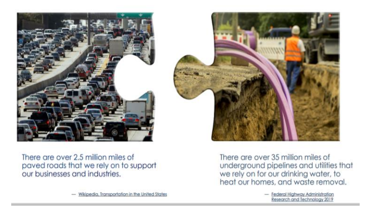
Exhibit 8: Underground Infrastructure Grid

According to data from the Federal Highway Administration, over 35 million miles (56 million kilometers) of sub-surface utilities exist, with many more remaining unidentified in the U.S. These could be telephone lines, internet cables, water, electric and gas lines, or sewage outlets, which are at risk every time any excavation or digging activity is undertaken.