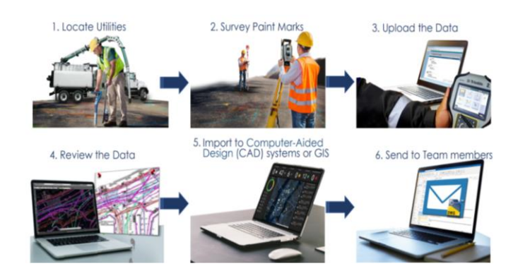
Exhibit 3: Current Data Workflows

ProStar®'s flagship product, PointMan®, addresses the current, yet outdated method of identifying buried utility lines. Currently, utilities are often not mapped and if they are mapped, they are in paper form as drawings or sketches, which are often not accurate. The current method of identifying the location of buried utility lines includes using a utility locate device and using spray paint to mark the approximate location of where the utility line is buried.