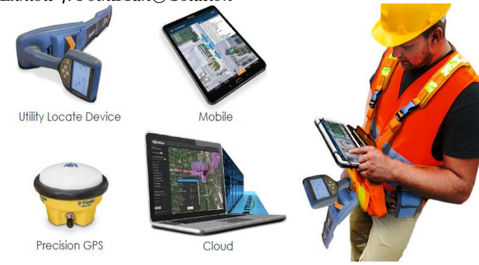
Exhibit 4: PointMan® Solution

Furthermore, PointMan® can create and bind forms, sketches, and photos to any point, line, or polygon, while integrating seamlessly with leading GPS/GNSS and cable & pipe locate equipment manufacturers such as Trimble, Juniper, Bad Elf, RadioDetection, Vivax, and Subsite Cable & Pipe Locator. In addition, the application can capture photos and digital sketches of project sites, customize data dictionaries and support export data formats like ML, KMZ, CSV, Shapefile, PDF, print, and GDB.