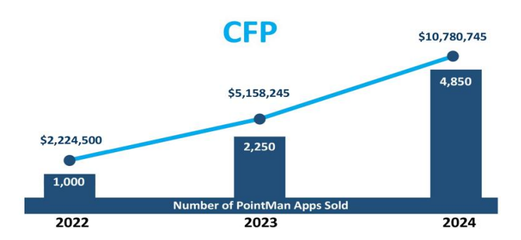
Exhibit 7: Annual Recurring Revenue Projections

Given the Company's confidence in its PointMan® software solution as a superior solution to current methods, coupled with its early stage, it has provided potential projections for its growth over the next couple of years through 2024.