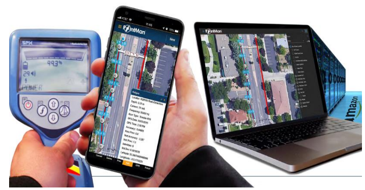
Exhibit 6: PointMan® Solution

PointMan® is also being used by Landmark EPC, a Subsurface Utility Engineering (SUE) Services provider that uses state-of-theart geophysical sensing equipment to map existing utility infrastructure. The company is using PointMan® to map buried infrastructure for the City of Boulder.