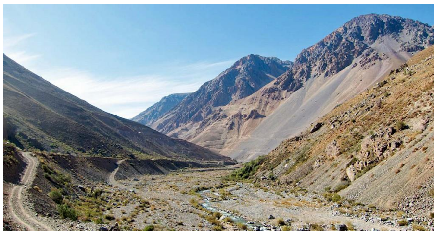
Exhibit 4: Vizcachitas project site looking north

Should RCF sell the second royalty prior to Los Andes beginning commercial production they will be responsible for an additional $5.0mn payment to Los Andes under the terms of the second royalty.