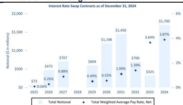
Exhibit 3: ARR Hedge Overview

ARR funds its Agency MBS almost entirely through repurchase agreements — short-term, collateralized borrowings with maturities from overnight to a few months. Because repo costs float with short-term rates, the Company must manage both the absolute level of funding costs and the stability of its lender base. ARR does this by maintaining relationships with multiple repo counterparties, by making active use of its affiliated broker-dealer BUCKLER as a significant funding source, and by holding a substantial buffer of liquidity and unencumbered assets to meet margin calls. In recent periods, more than 40% of repo was with BUCKLER Securities LLC which underscores both the importance of that channel and management's intent to preserve financing flexibility even when markets are choppy. The target leverage range in the high-7x to low-8x area is consistent with an agency book in a normalized spread environment — high enough to deliver double-digit ROEs, but not so high that modest mark-to-market volatility would trigger forced deleveraging.