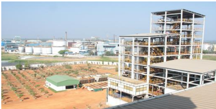
Exhibit 11: Kakinada, India Plant

Biodiesel is produced from vegetable or animal fat waste feedstocks and is then sold as a transportation fuel and a chemical in the textile market. This plant's biodiesel meets the international product standards so it can be sold in the domestic Indian market as well as internationally.