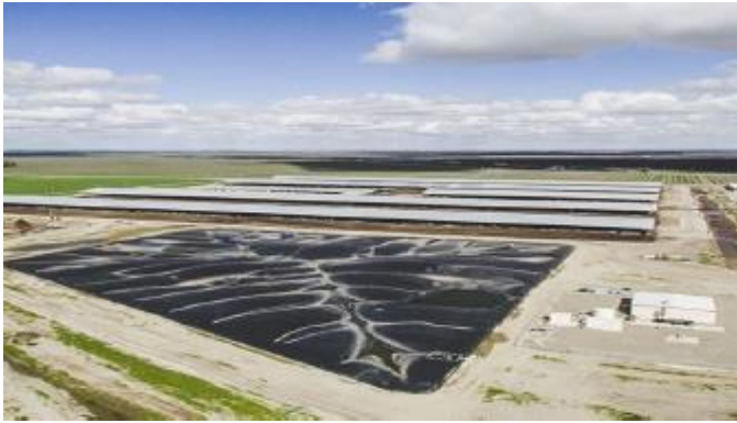
Exhibit 1: Dairy Biogas System

Aemetis, Inc. is a renewable fuel and biochemicals company focused on producing low carbon products that replace traditional petroleum-based products. The Company's innovative technologies replace petroleum-based products primarily through the conversion of first-generation ethanol and biodiesel plants into advanced biorefineries. The Company is seeking to leverage its technology and experience to increase production of existing products as well as expand its portfolio of higher value products.