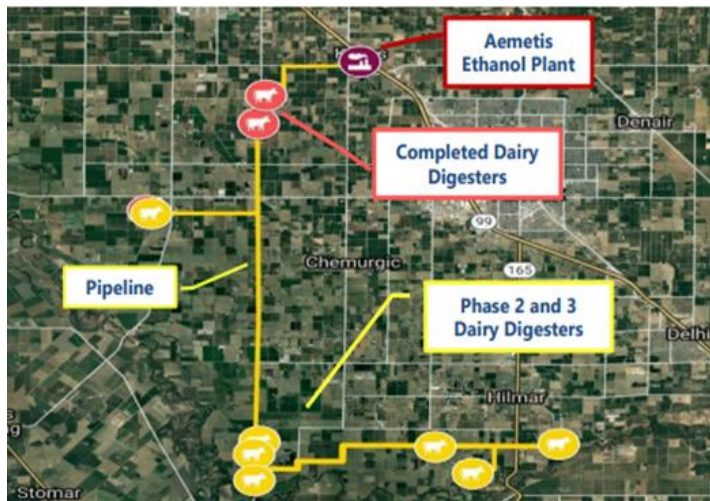
Exhibit 5: Dairy Biogas System

The project is expected to capture the methane biogas from dairy wastewater lagoons and pipeline the gas to the Keyes plant for processing. Once the biomethane is produced, it can be used as transportation fuels to replace diesel in trucks; used in the Keyes plant to replace petroleum natural gas; or used in the on-site fueling station being built at the Keyes plant.