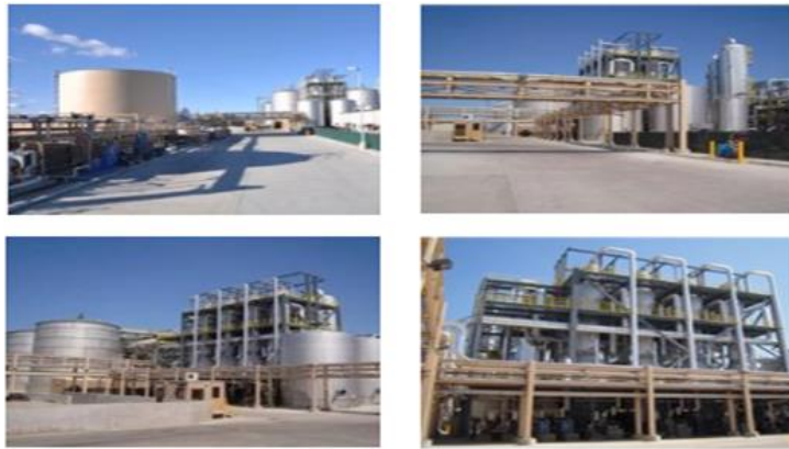
Exhibit 2: Keyes, California Ethanol Plant