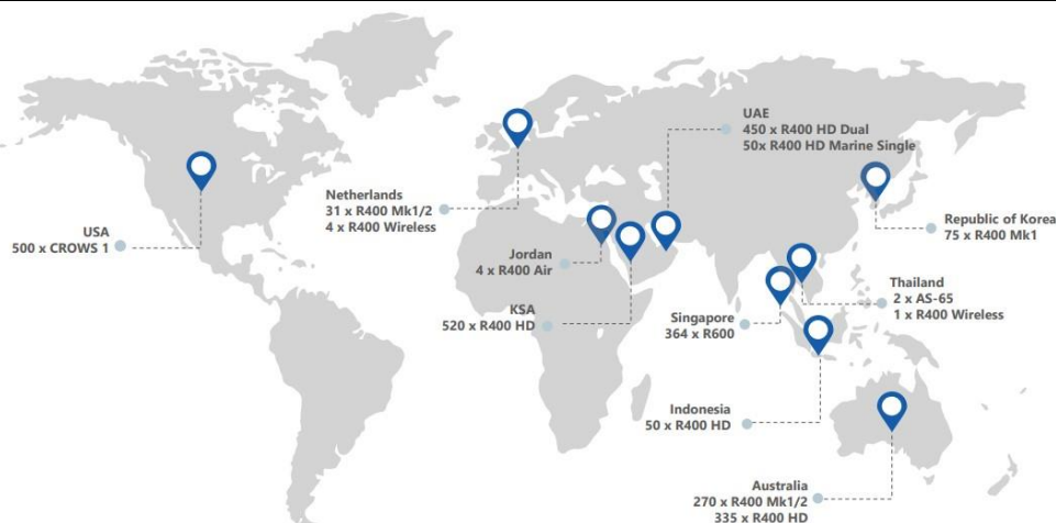
Exhibit 1: Operating Areas

The Company was originally founded in 1983 from the privatization of Australia’s government space activity. In the late 1990’s and early 2000’s, EOS began expanding globally and now serves markets in Australia, the United States, Europe, the Middle East and Southeast Asia. To date, the Company’s flagship product (the RWS 400) is well established and has sold over 2,500 units over fifteen years, working with more than ten different nations. The Group has grown to become the largest defense exporter in the Southern Hemisphere, with exports accounting for ~90% of revenue. In 2000 the group was officially listed on the Australian Securities Exchange under the symbol “EOS.”