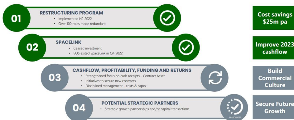
Exhibit 3: Turnaround Strategy

a backlog of A$450m. In the short term, cashflows were down in 2022 due to delays in cash collections, lower customer activity levels, and costs associated with restructuring the business. However, the Company is now in a solid position to drive its cash performance in 2023 and 2024. If EOS sticks to its turnaround strategy, its reputation should improve, allowing the business to grow. Most recently we note that the Company has generated a positive operating cash flow of A$30.7m in 1H23. We view this as proof that the Company is taking the necessary steps to execute on its turnaround.